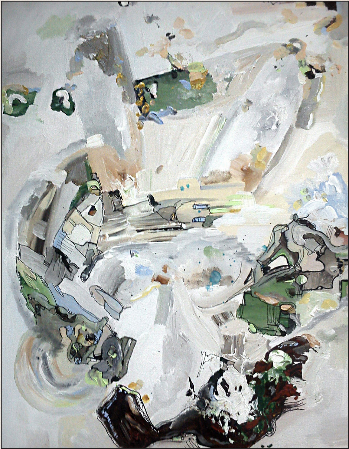
Forsaken 18" x 24" - acrylics, ink & mixed media on canvas // SOLD (prints can be made available)