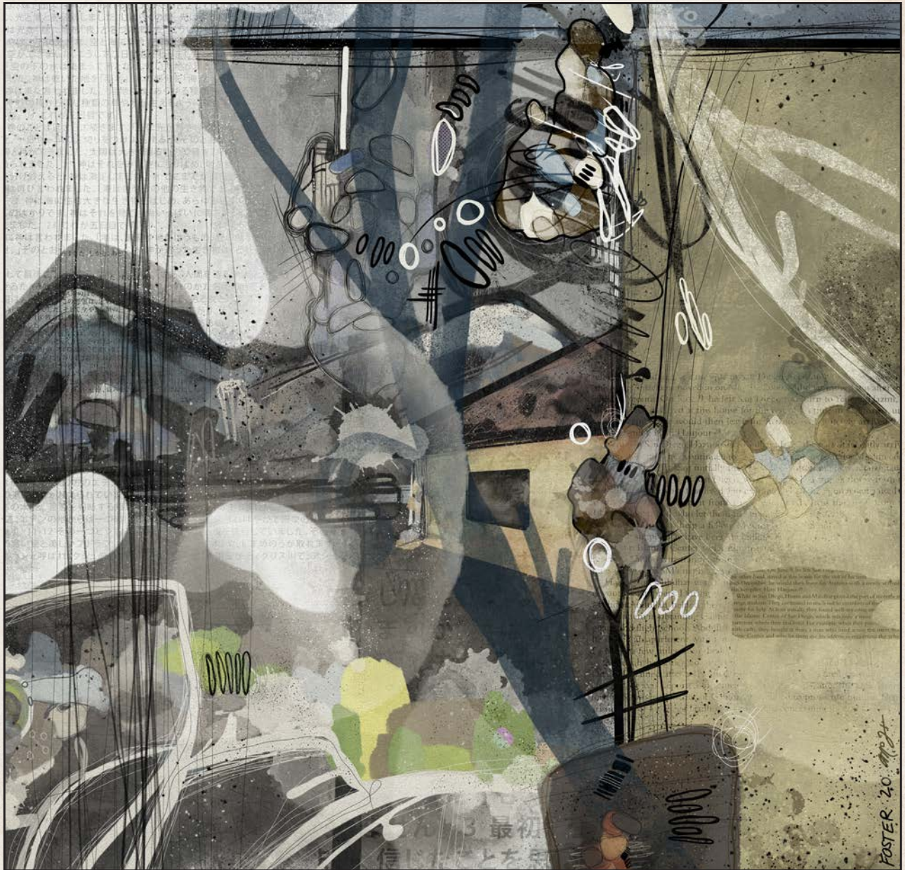
Alone (2020) digital illustration // can be printed at any size with a 1:1 ratio