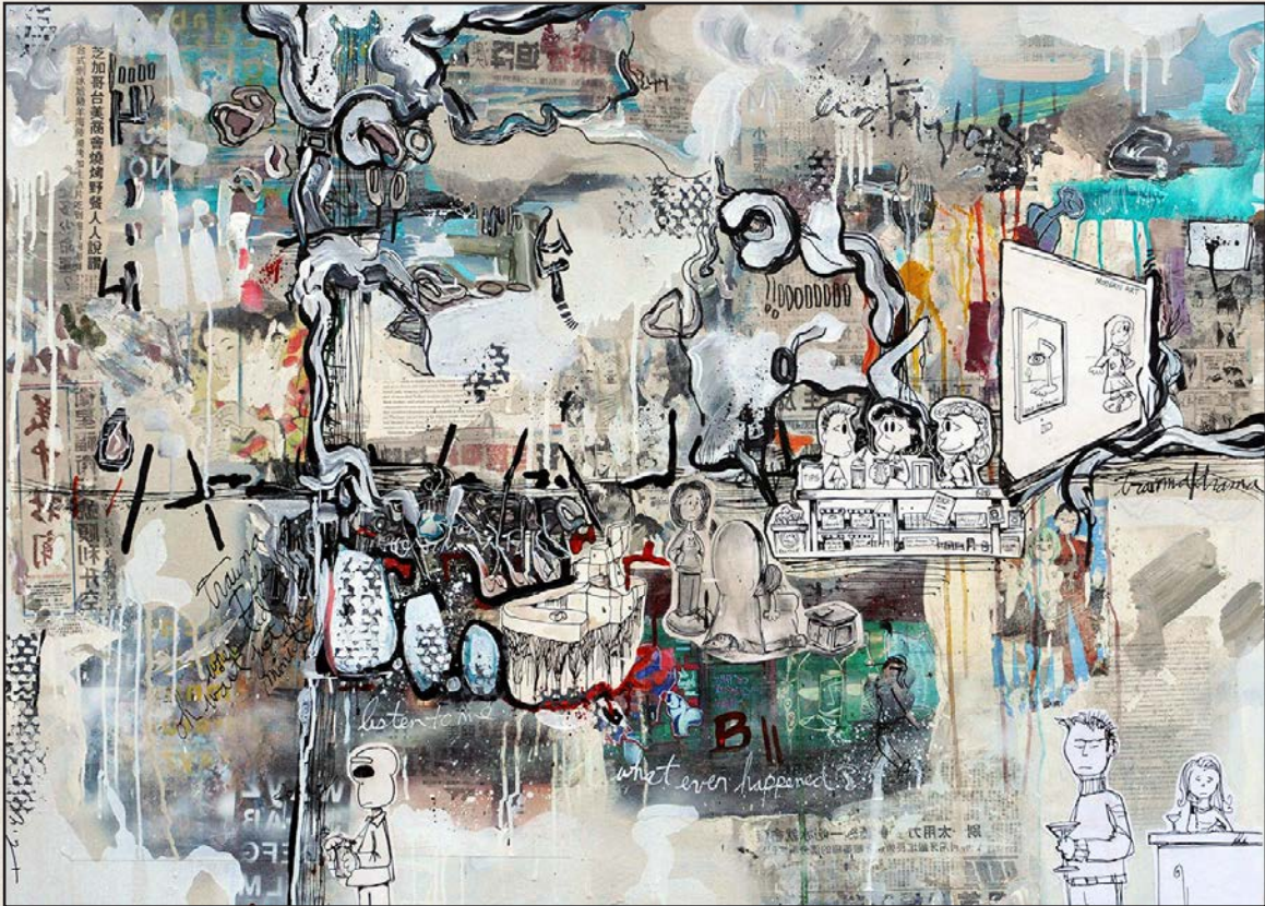
TOP: Running Out of Time (2015) 48" x 36" acrylics, ink & mixed media on wood - SOLD