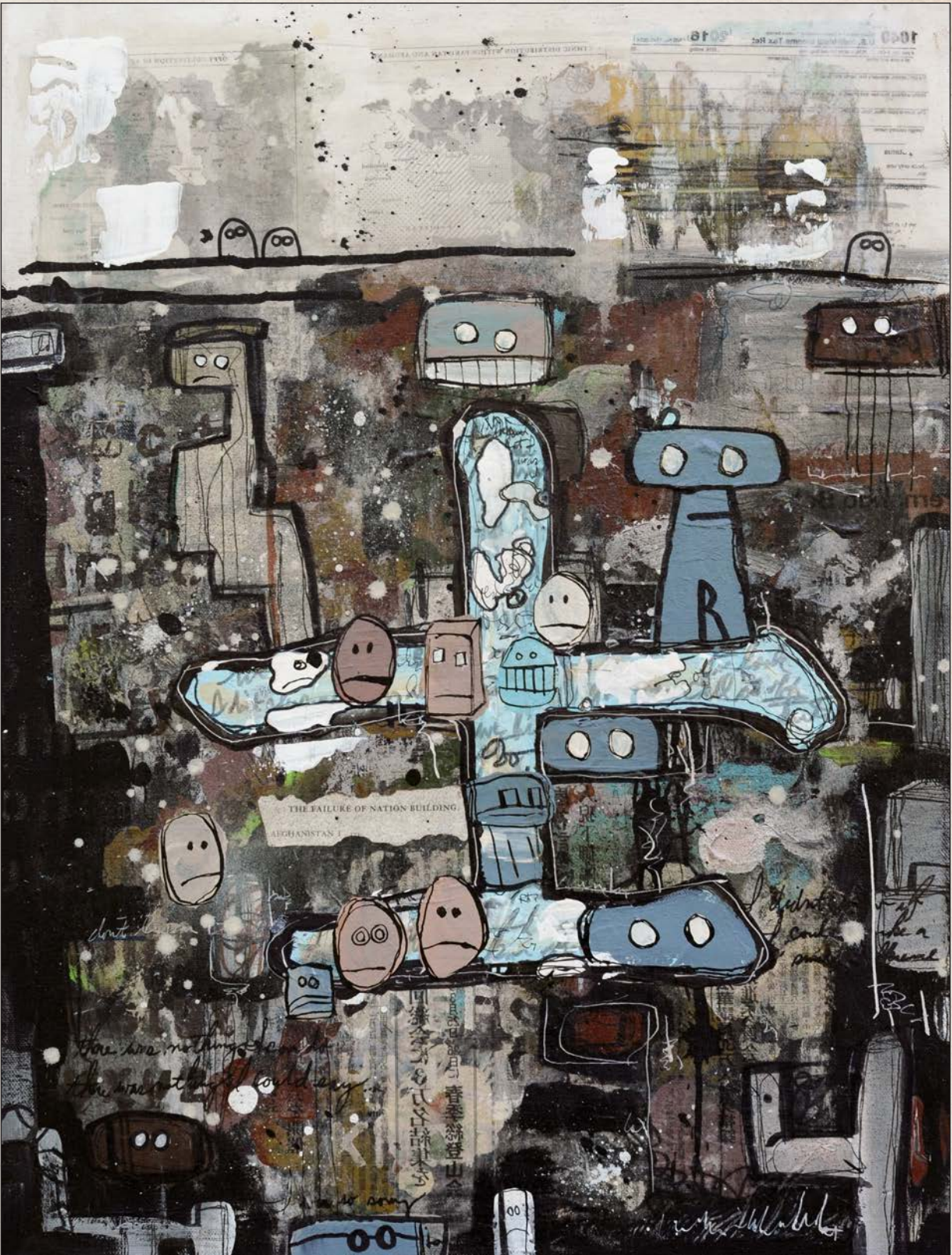
Spectators (2017) 18" x 24" acrylics, ink & mixed media on canvas - $1100