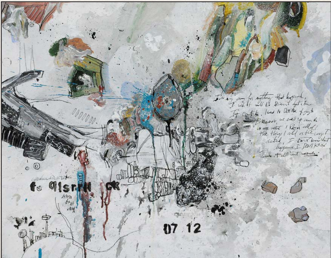
TOP: Popsicle Toes (2015) 36" x 24" acrylics, ink & mixed media on wood - $1450